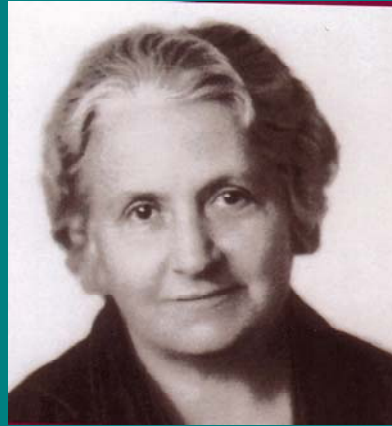
1870 – 1952 Dr. Maria Montessori

“...it is the child that must lead us...” not the other way around