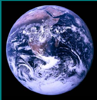
Our Earth Our Children

“I beseech you, do not go around speaking of an educational method that has convinced you, nor of having studied the way to make culture for children easy, universal and attractive. Therefore, speak to everyone of the child and his secret; unveil the truth; reveal the powers of this ‘spiritual embryo’ of the human soul; proclaim him for what he is; the father of man; the builder of humanity, the creative and transforming energy which can act on the hearts of men and can offer new elements for the solution of social problems”